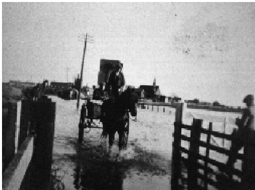
Above: Top of Rye Harbour Road in 1930