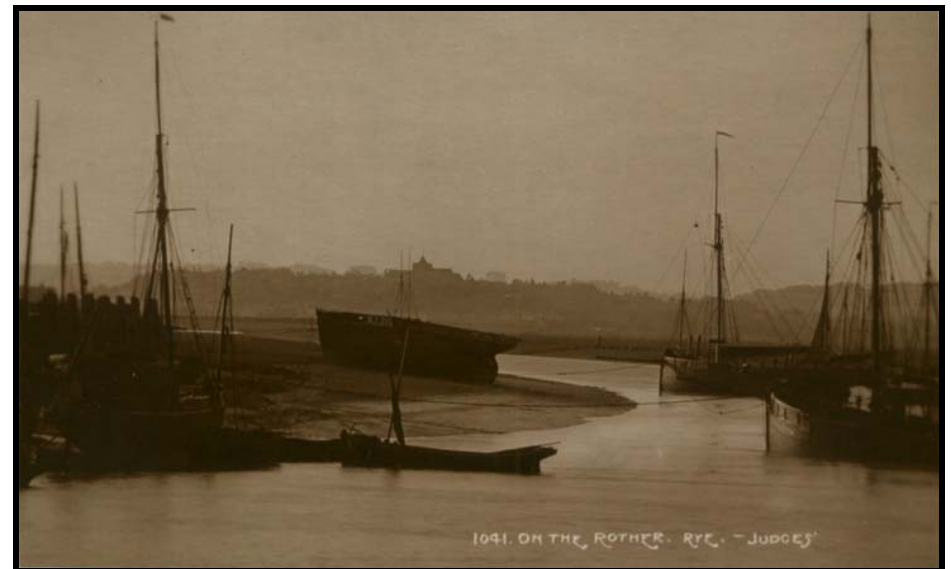
Picture postcard of Rye from Rye Harbour about 1910