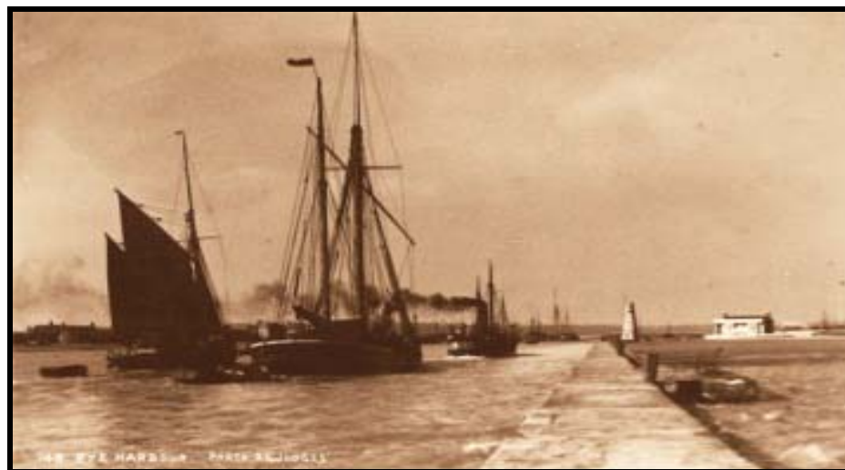
Picture postcard of Rye Harbour courtesy of Judges taken by Fred Judge about 1906