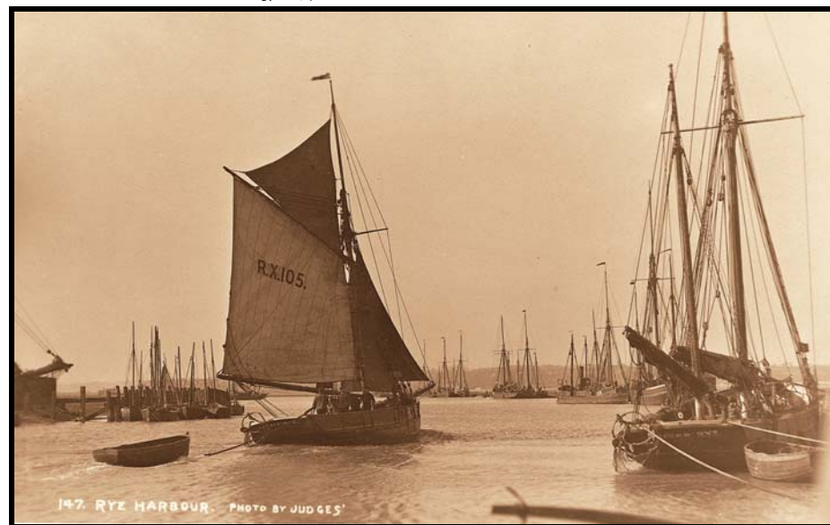
Picture postcard of Rye Harbour Looking Out To Sea about 1906

Tuesdays 10.30 am - 12.30 pm Tuesdays 1.30 pm - 3.30 pm No Appointment Necessary Wednesdays 2.00 pm - 4.00 pm Appointments Necessary Rye Partnership Office (Rye) 01424 215055 / 734549 Or you may telephone, on 0870 1264101 7 Days a Week -24 Hours a Day